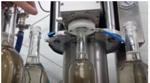
Manual capping with help of corker www.youtube.com/watch?v=UiuEXjB0Elk