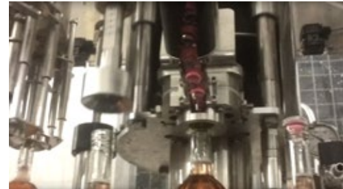
Semi Automatic Bottling GAI www.youtube.com/watch?v=7dYHQA6gLMc