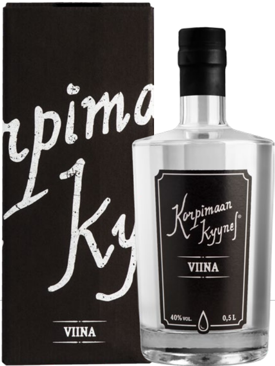
W&K Premium Oy