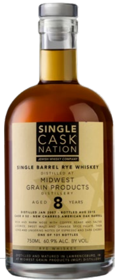
Single Cask Nation