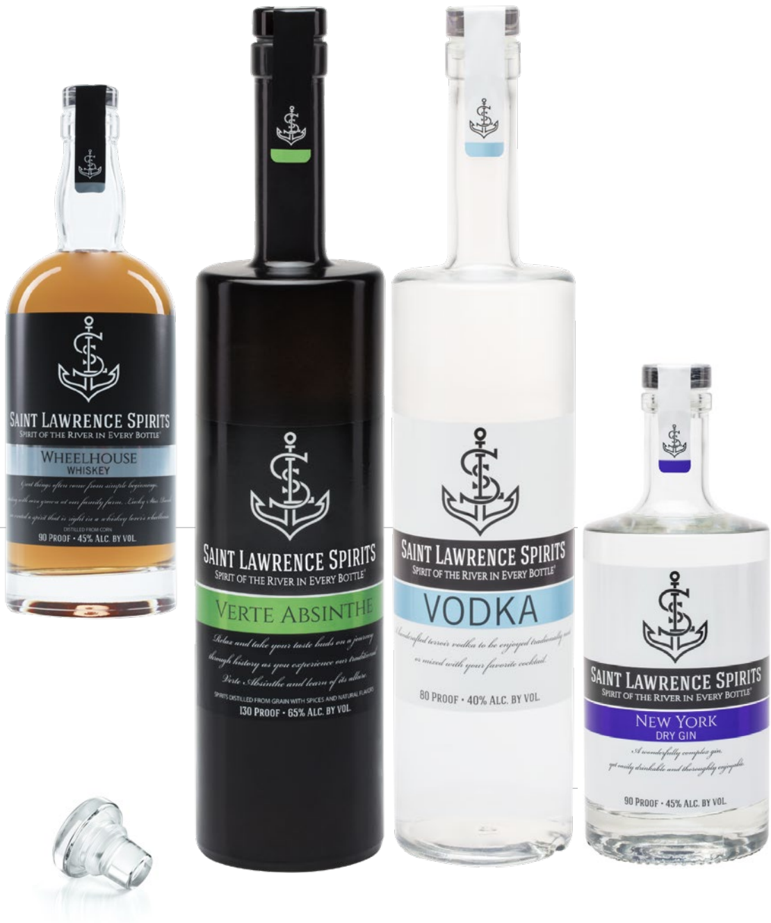
Saint Lawrence Spirits United States