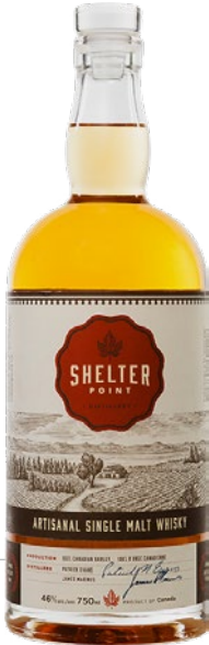
Shelter Point Distillery

is the purest expression of grain distillation and the finest example of a neutral grain spirit. It is rich in texture and warmth, while devoid of impurity, colour, and harsh flavour.