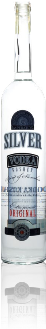
Stock Plzeň - Božkov