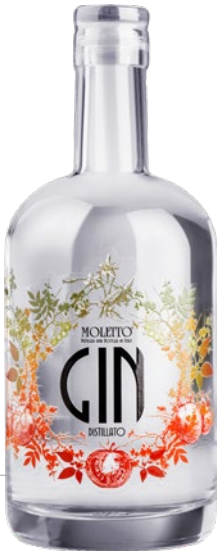
Moletto Società Agricola s.s.