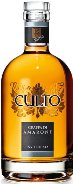
Antiche Distillerie Riunite