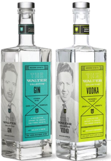
The Walter Collective