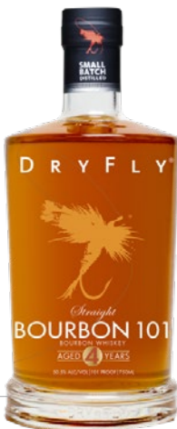
Dry Fly Distillery