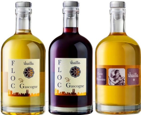
Domaine de La Haille