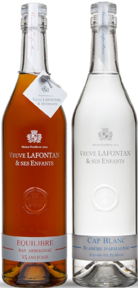
Veuve Lafontan & ses enfants