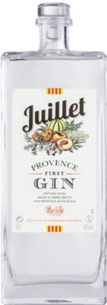
Château des Creissauds