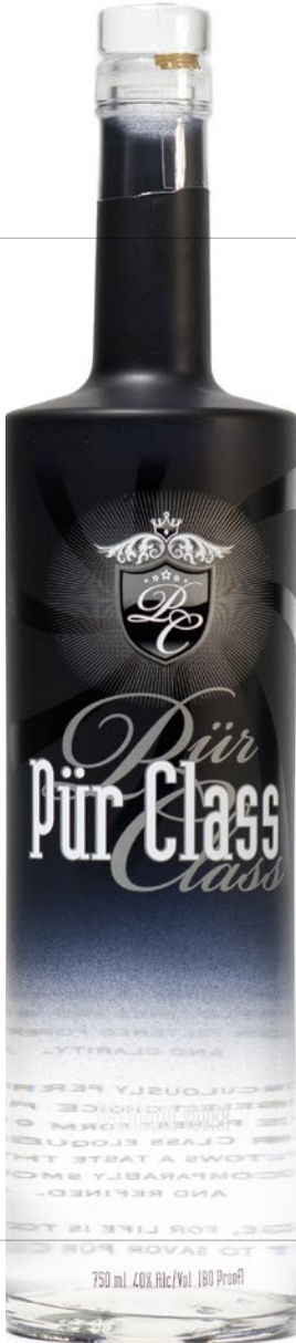
Hendrick Family Distillery