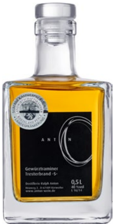
Destillerie Ralph Anton