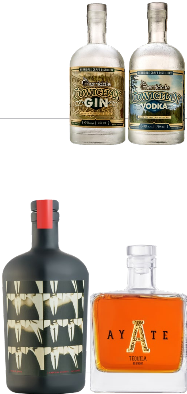
Merridale Cidery & Distillery