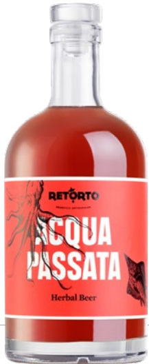
Retorto Birrificio Artigianale