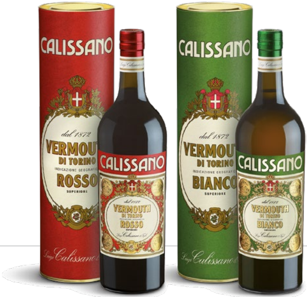
Gruppo Italiano Vini