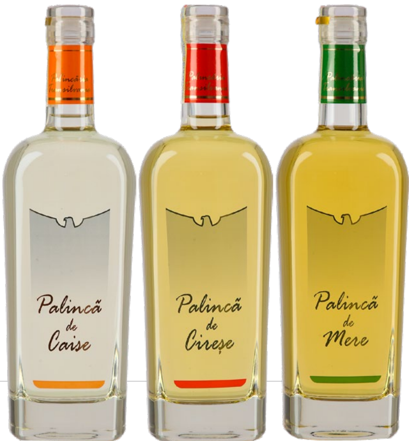
Palincă de Cireșe