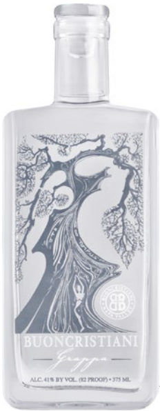
Buoneristiani Family Winery