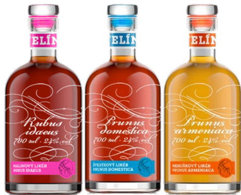
Rudolf Jelínek Distillery