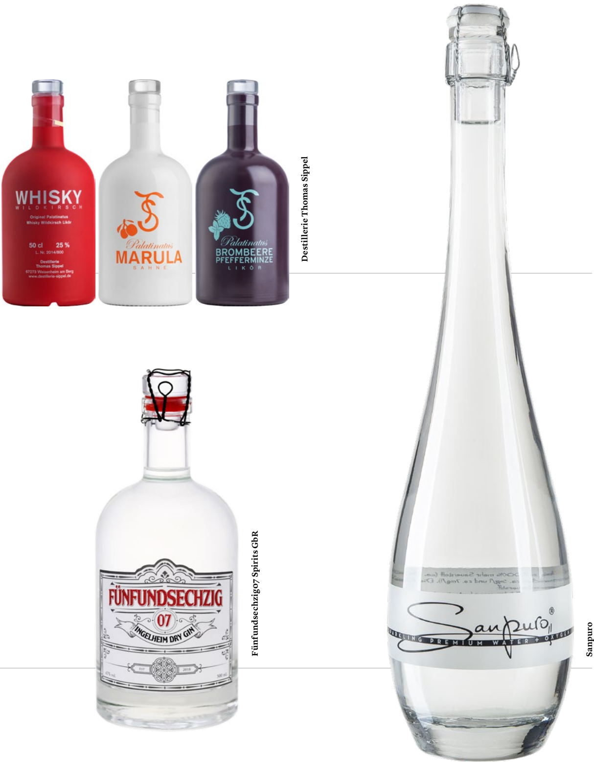
Destillerie Thomas Sippel