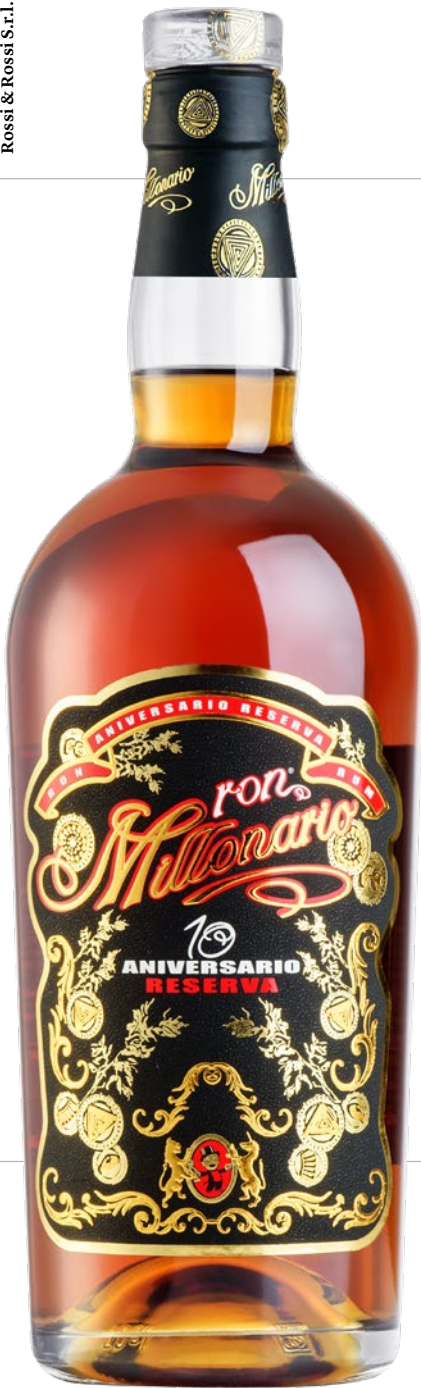
Rossi & Rossi S.r.l.