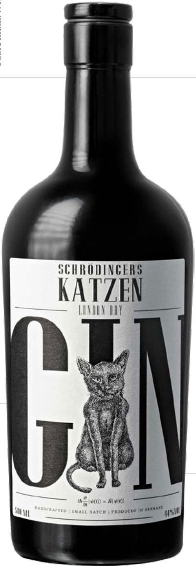
HS Heidelberg Spirits