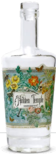
Nickel & Distillery