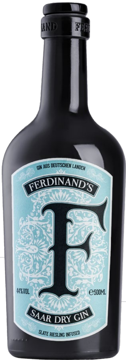
Capulet & Montague