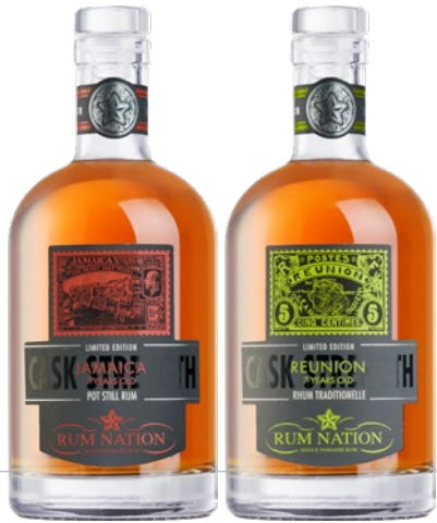
Rossi & Rossi S.r.l.