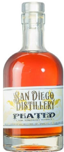
San Diego Distillery