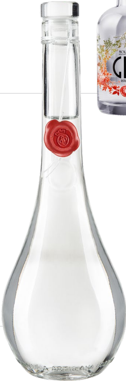
Distilleria Carlo Gobetti

The gin distillate is mixed with pine cone essence (a special Roner recipe), which gives the gin its unique flavour. The cones come from the Weisshorn mountain (Tramin, South Tyrol). The essence from the cones presents fresh, resinous and mentholy notes.