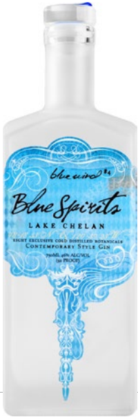
Blue Spirits Distilling