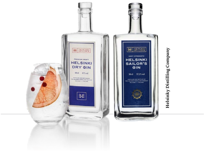
Helsinki Distilling Company