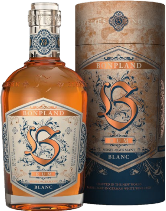
Avadis Distillery / Capulet & Montague