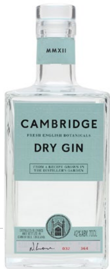
The Cambridge Distillery