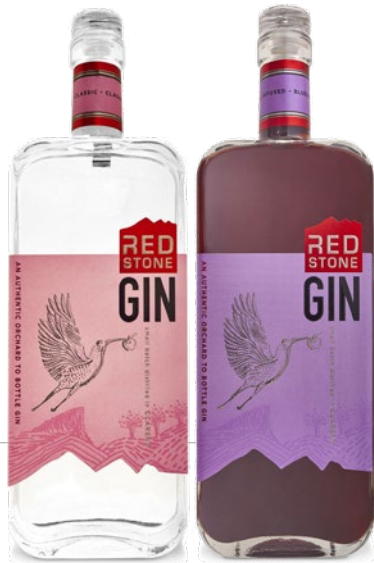
Red Stone Craft