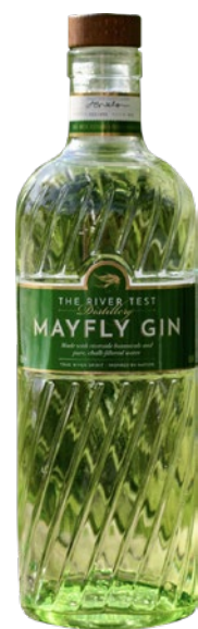
The River Test Distillery