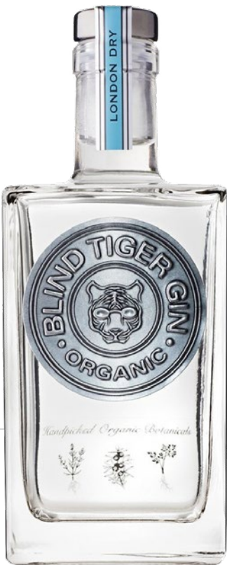
Blind Tiger Distillery