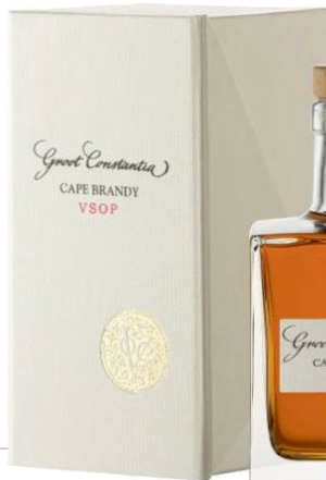
Antiche Distillerie Riunite