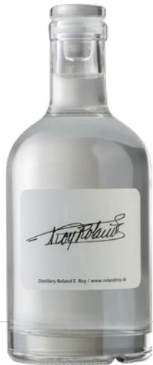
Roland Roy Artisan Distillery