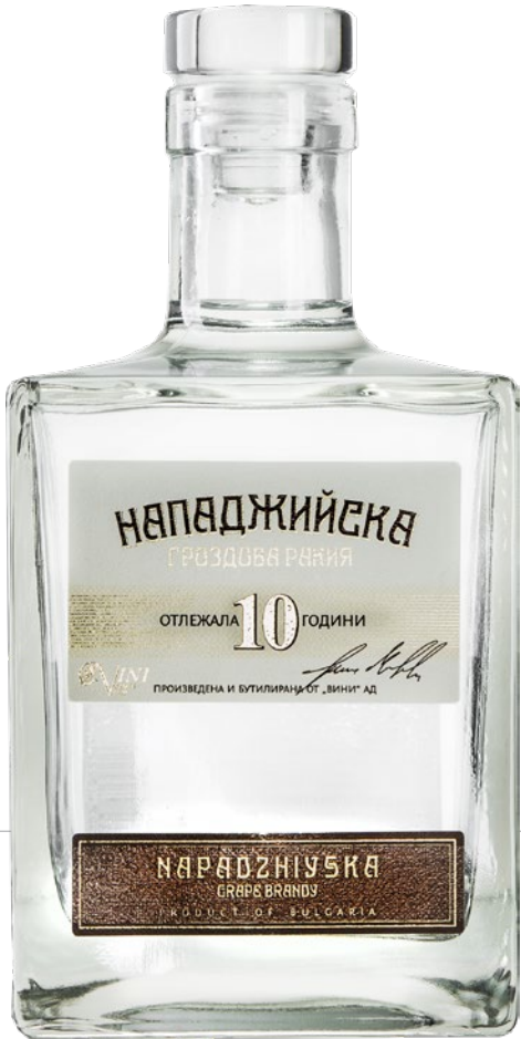
Vini AD Sliven