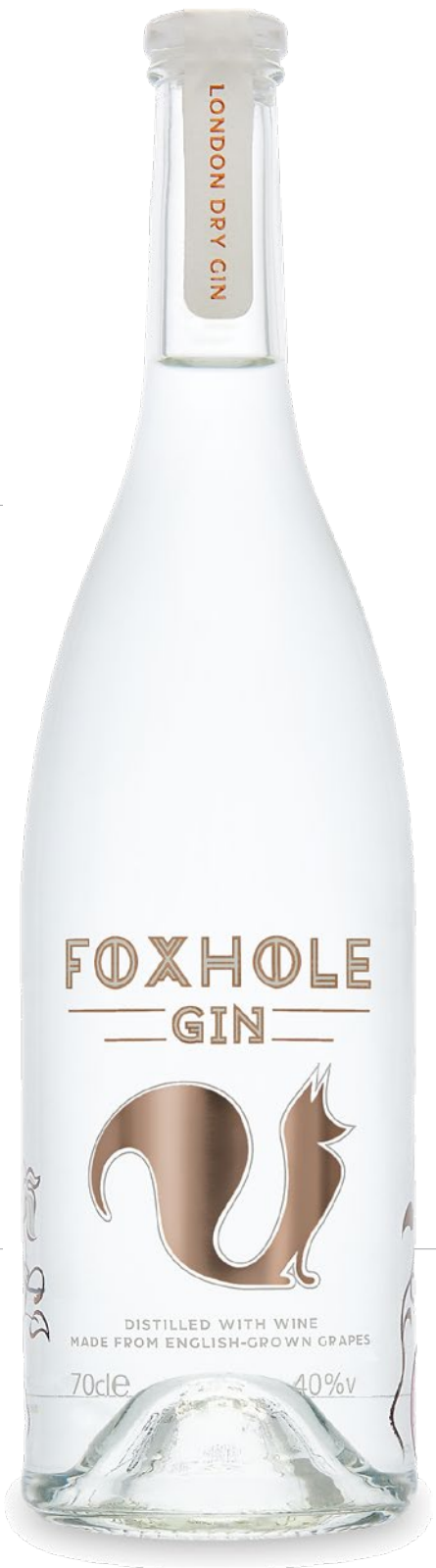
Foxhole Spirits Limited