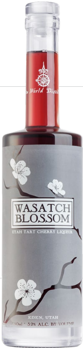
New World Distillery

From local farms to your glass, every drop of Ethanology is authentically crafted in extremely small batches. The custom 500L batch distillation system allows us to craft every product with uncompromising attention to detail & quality.