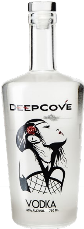
Deep Cove Brewers and Distillers