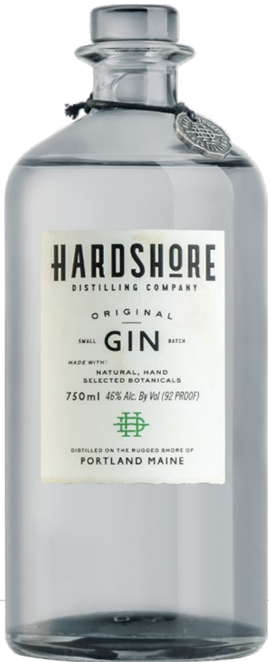
Hardshore Distilling Company