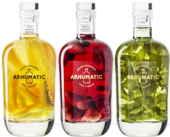
La Maison Arhumatic