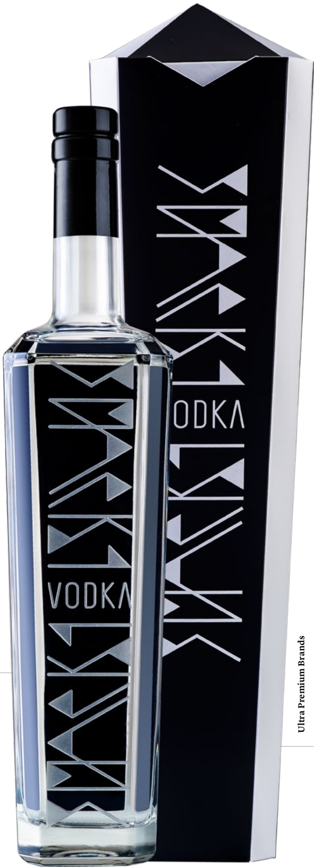
Ultra Premium Brands