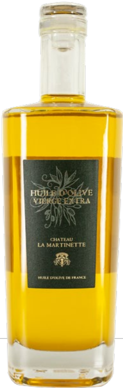
Château la Martinette