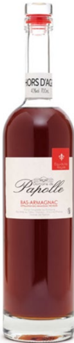
Domaine de Papolle