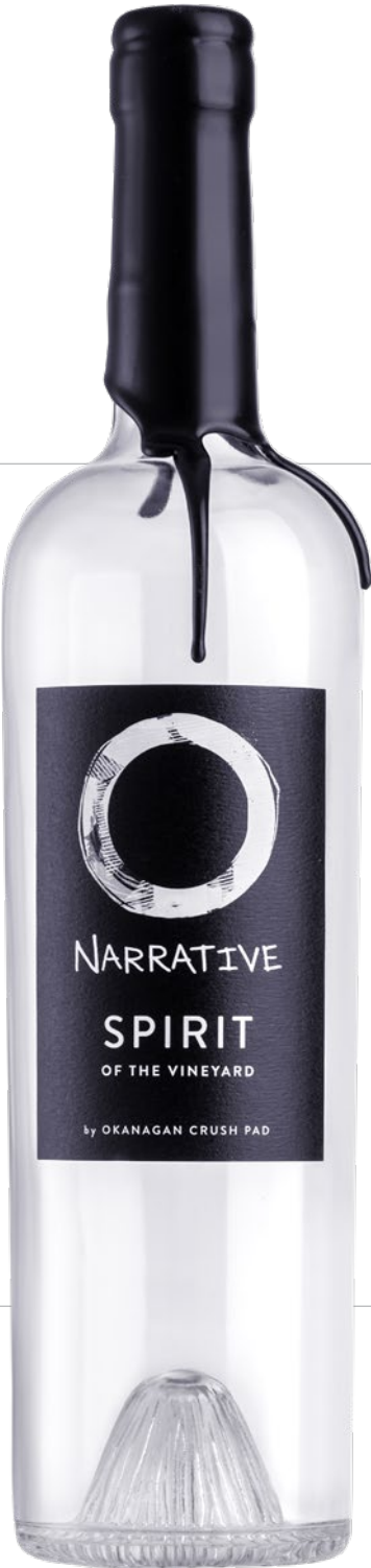
Okanagan Crush Pad