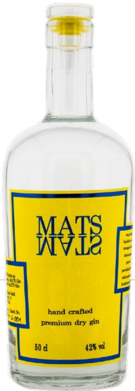
MAT'S Spirits GmbH