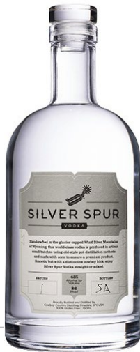
Cowboy Country Distillery