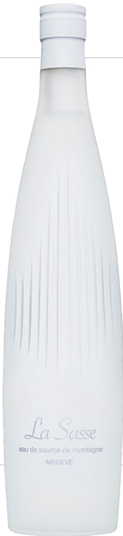
Domaine de la Sasse