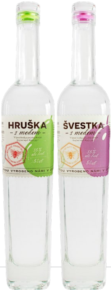
L'OR special drinks