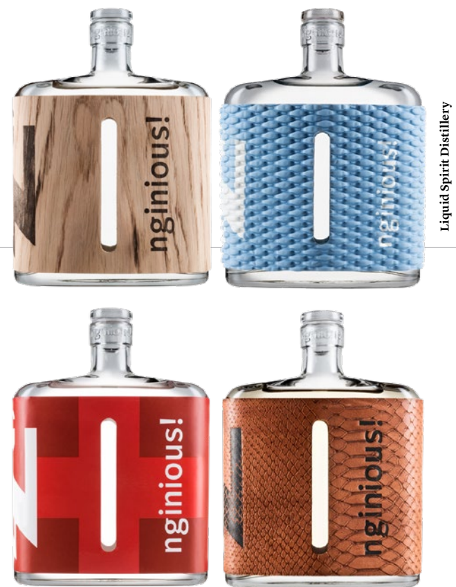
Liquid Spirit Distillery