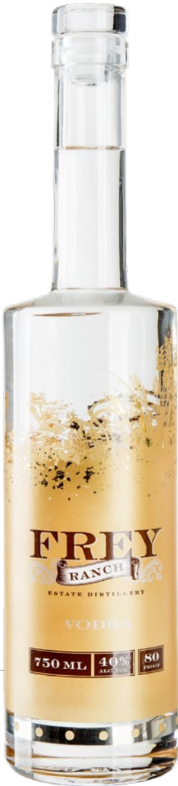
Frey Ranch Estate Distillery