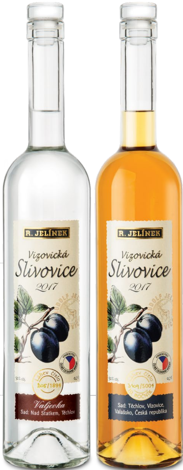
Rudolf Jelínek Distillery