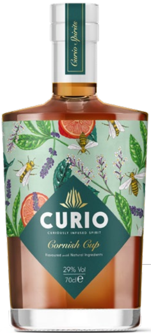
Curio Spirits Company