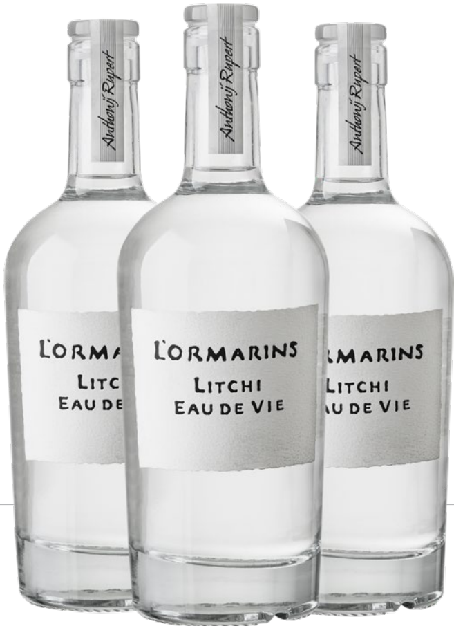
L'Ormarins Wine Estate