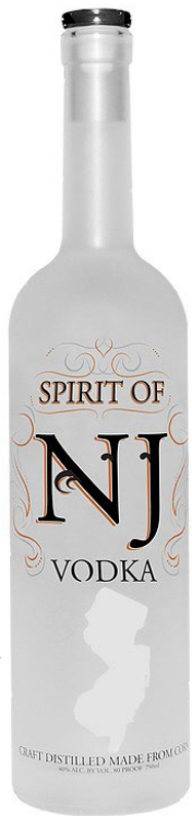
Copper Kettle Spirits