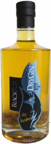
Black Fox Distillery