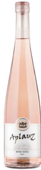
Villa Melnik, Bulgaria