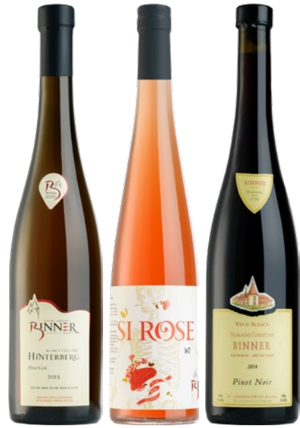
Domaine Christian Binner