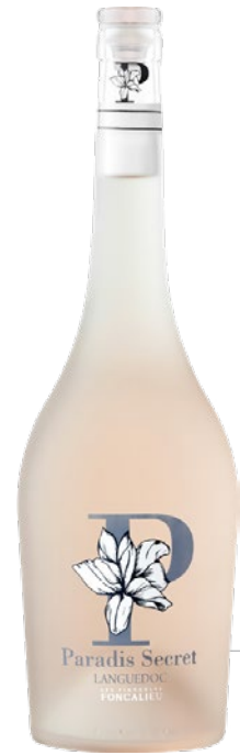
Les Vignobles Foncalieu