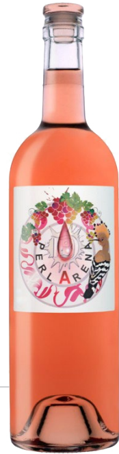
Bodega Dominio del Bendito