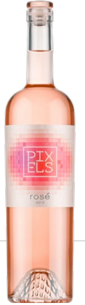
Vinprom Peshtera, Bulgaria