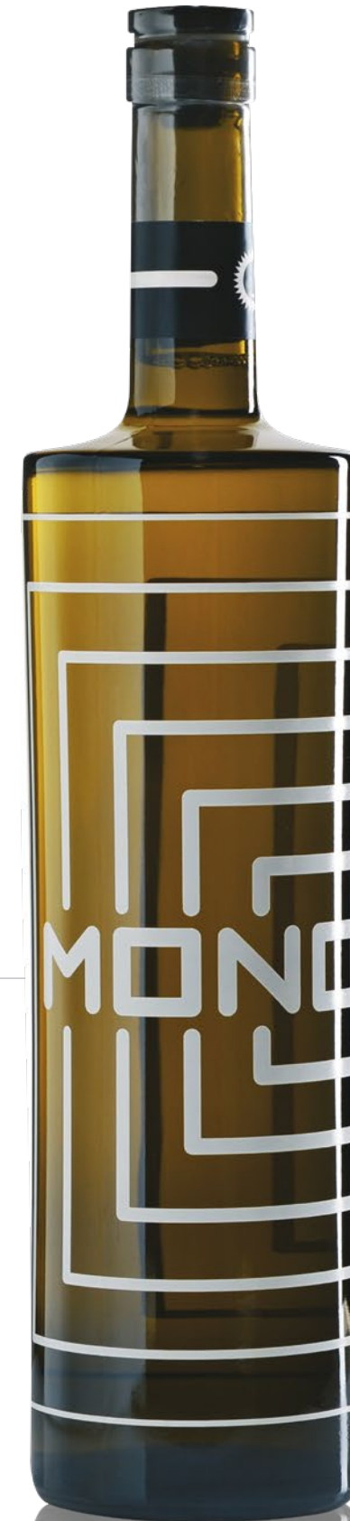
Tokaj Macik Winery