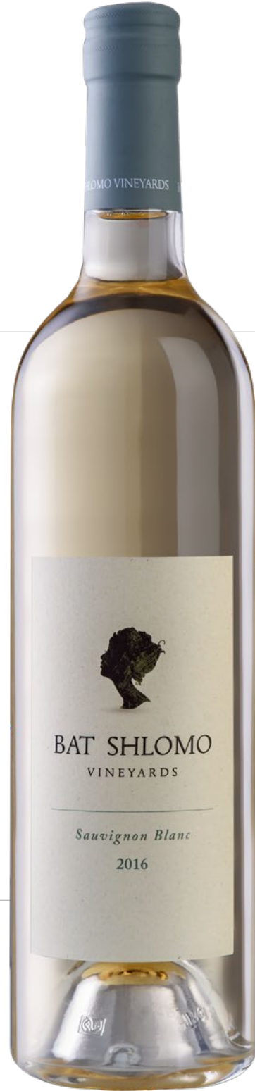
Bat Shlomo Vineyards, Israel