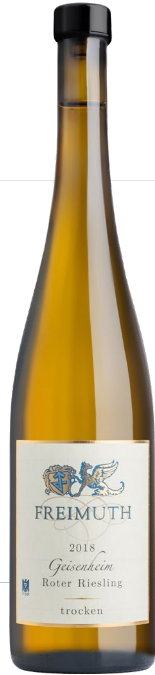
VDP Weingut Freimuth