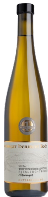
Weingut Heribert Boch