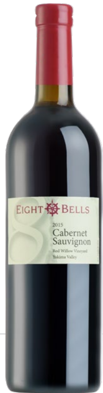
Eight Bells Winery