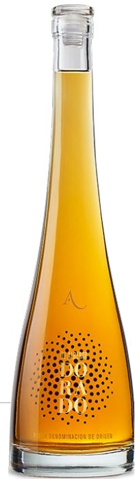
Bodegas Hijos De Alberto Gutiérrez