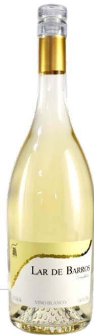
Bodegas López Morenas