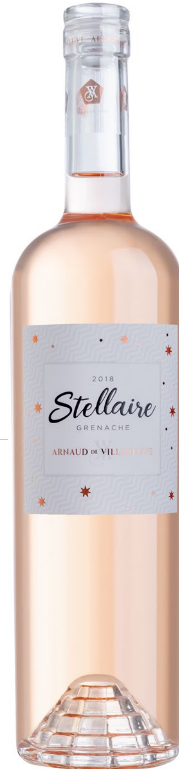
Arnaud de Villeneuve