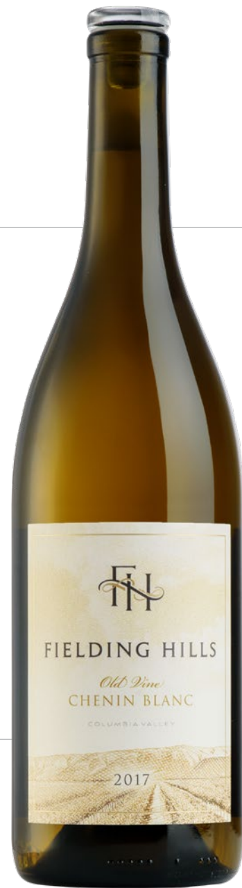
Fielding Hills Winery