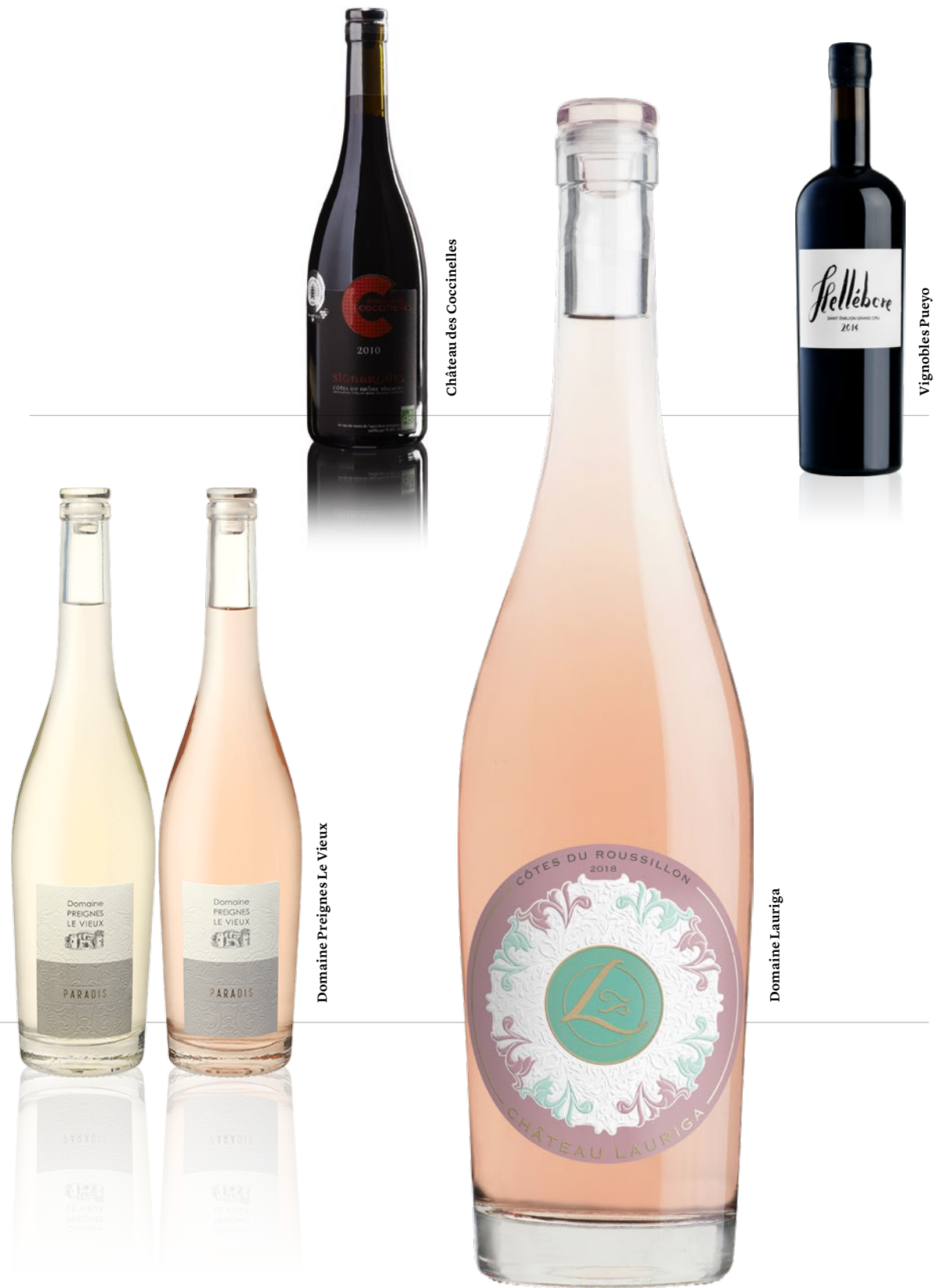
Domaine Prèignes Le Vieux