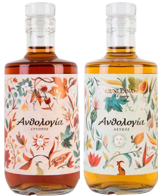
Vouni Panayia Winery