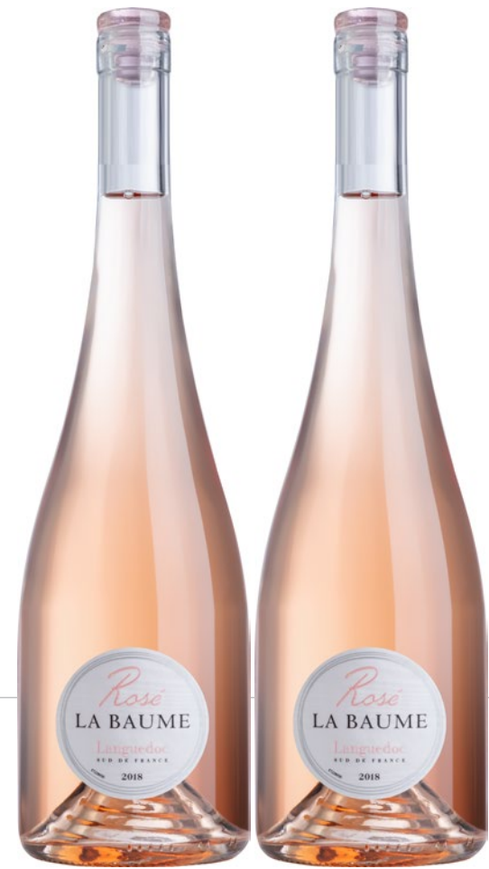
Domaine de La Baume