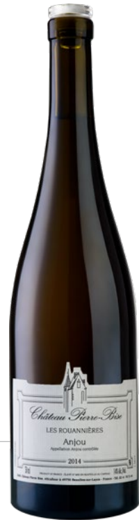
Château Pierre Bise