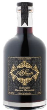
All Saints Estate