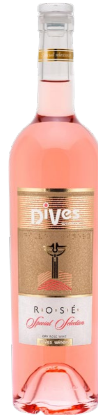
Dives Estate, Bulgaria