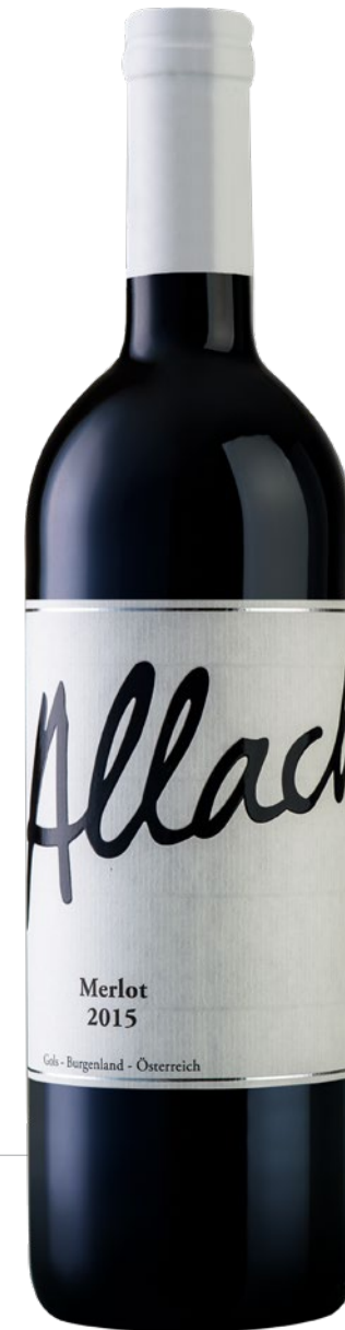
Allacher Vinum Pannonia