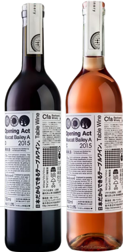
Cfa Backyard Winery, Japan