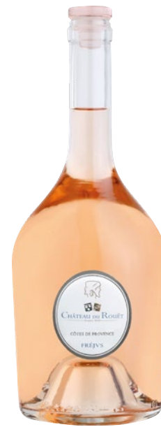
Château du Rouët