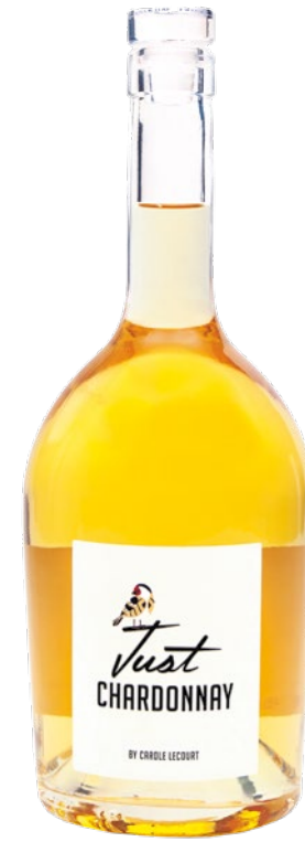
Vignobles Lecourt Caillet & filles