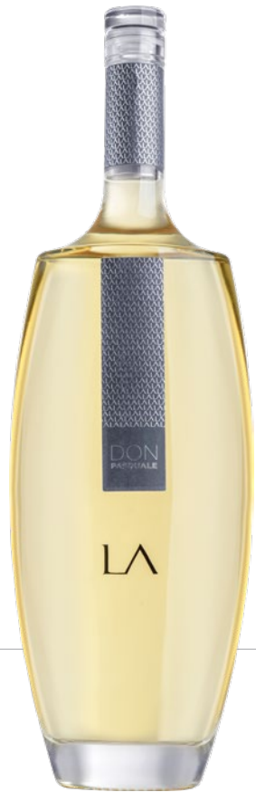
Domaine La Villa Angeli