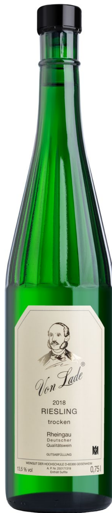
VDP Weingut der Hochschule Geisenheim