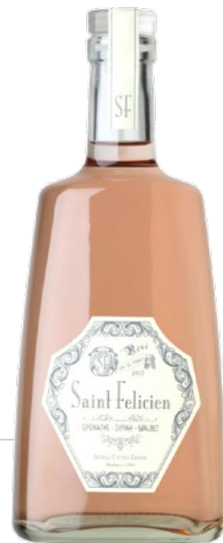
Bodega Catena Zapata, Argentina