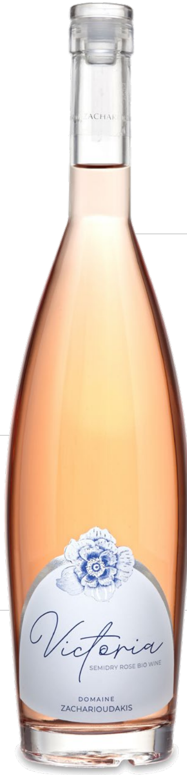
Domaine Zacharioudakis, Greece