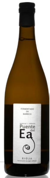
Bodegas y Viñedos Puente de la Ea