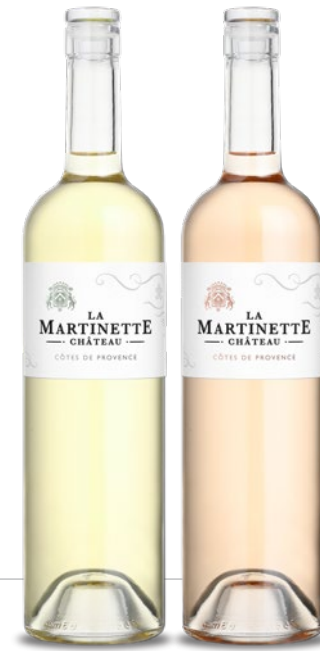
Château la Martinette