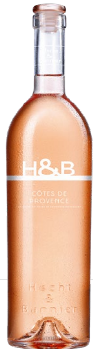
Hecht & Bannier