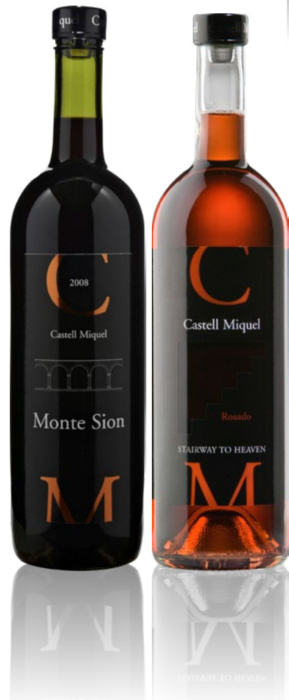
Bodegas Castell Miquel