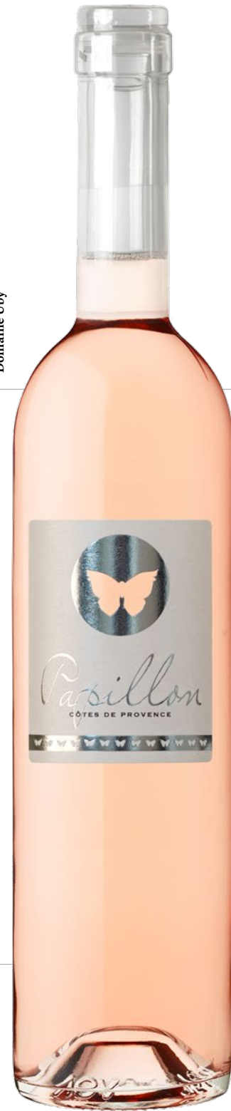
Château des Launes - Maîtres Vignerons de la Presqu'île de Saint-Tropez

The grapes for Cuvée Pauline are harvested late to obtain the best maturity. The result is a powerful and round wine with notes of vanilla, almond and truffle mouth feel at the end. Slightly oaky, it is fresh in the mouth.