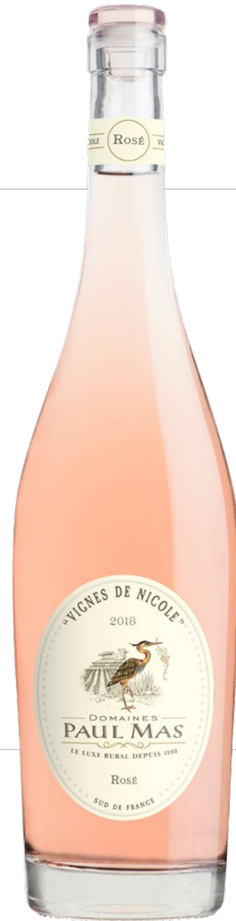
Les Domaines Paul Mas