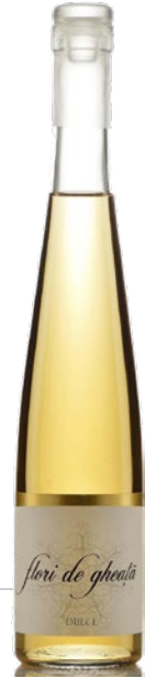
Domeniile Viticole Tohani