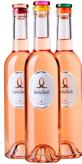
Santa Sarah, Bulgaria