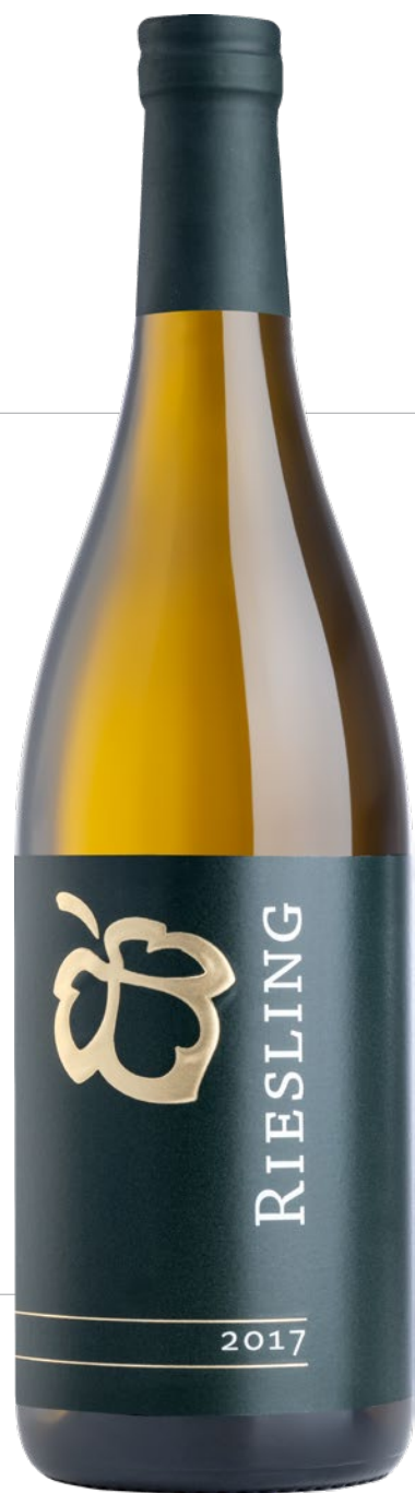
Weingut Rico Hänsch