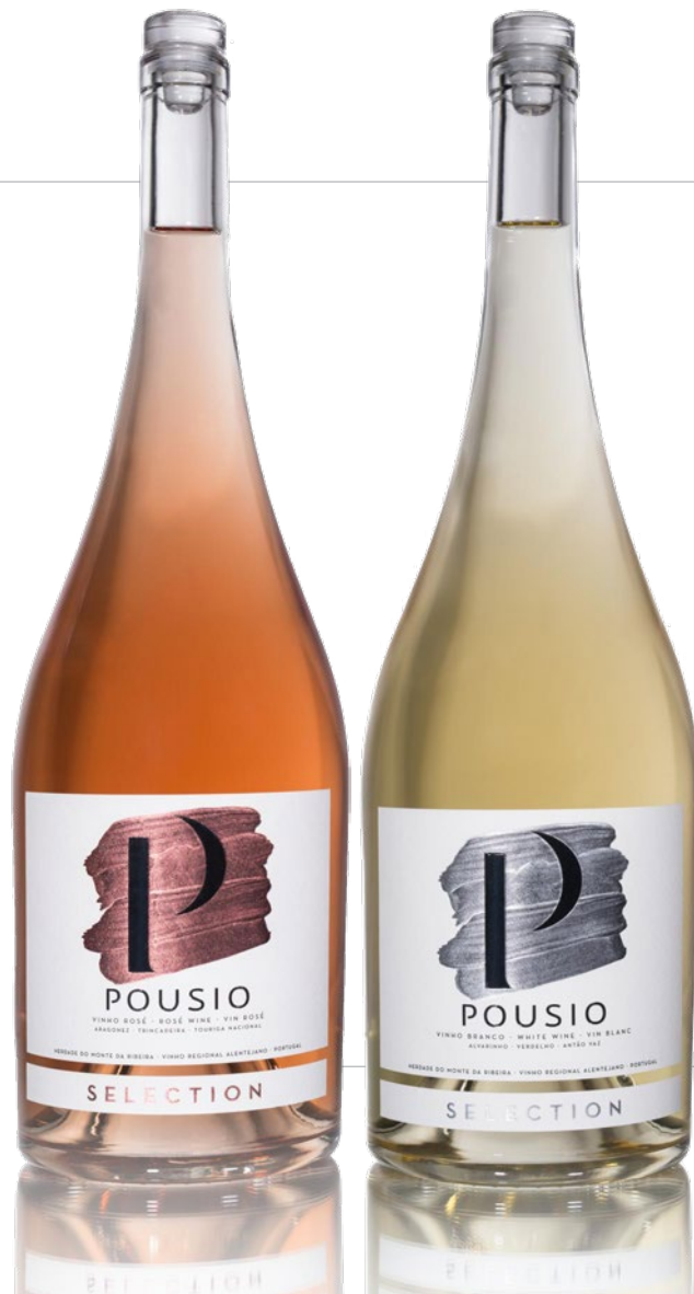
Casa Agricola HMIR

The Porto Tawny 30 Years old received 53 awards from respected organizations such as Decanter, Mundus Vini, International Wine Challenge and many other. This makes Sandeman the most awarded porto wine brand for six years in the row.