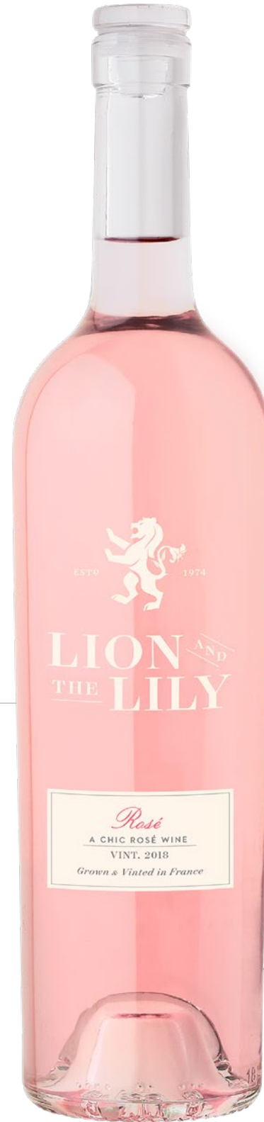
Vignerons de Tutiac