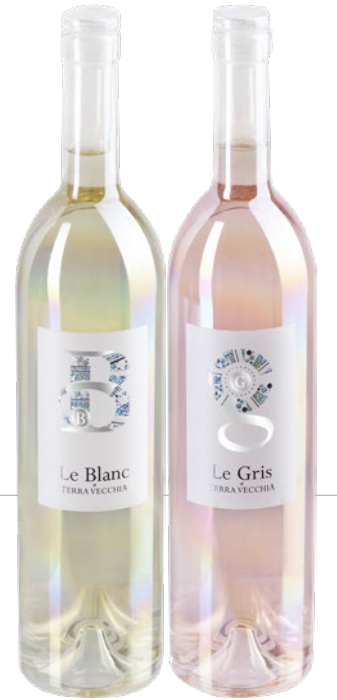
Domaine Terra Vecchia