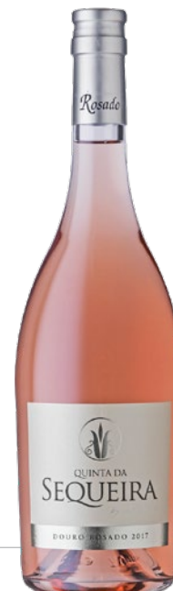
Quinta da Sequeira

PORTO TAWNY 30 Specially selected Portos are chosen for ageing in wooden casks, gradual exposure to air concentrates the flavours and matures the ruby colours to amber, creating the rare and delicious Sandeman Porto Tawny 30 Years Old. The ageing process intensifies the fruit creating the complex flavours characteristic of Tawny Porto, a perfect ending to any meal and an inspiration for good conversation.