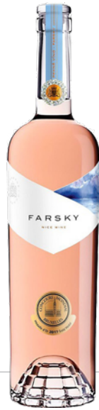
Farsky Nice Wine