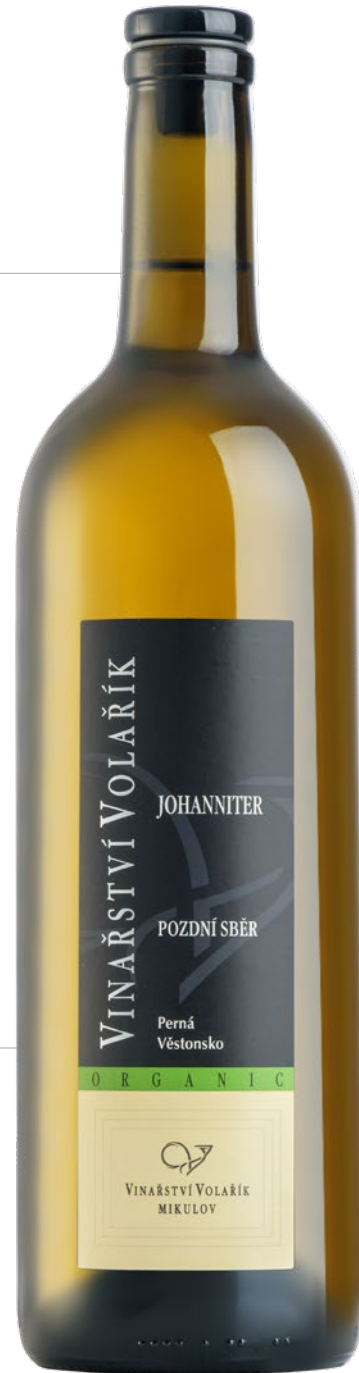
Vinařství Volařík Mikulov

Marhulové wine is our tribute to Velkopavlovice apricot, which comes from the same region as our family. Of all apricot varieties, the Velkopavlovice apricot has the richest taste, which is preserved in this dessert wine for extraordinary moments.