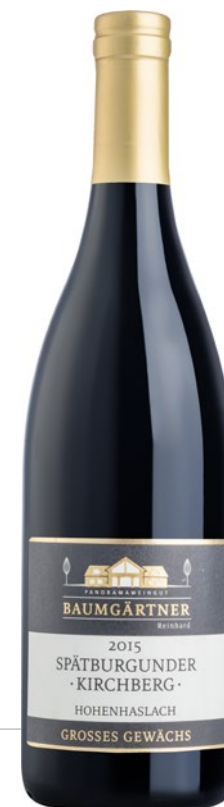
Panorama Weingut Baumgärtner