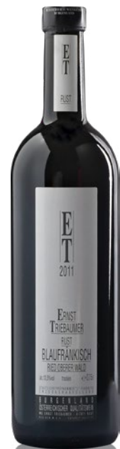
Weingut Ernst Triebaumer