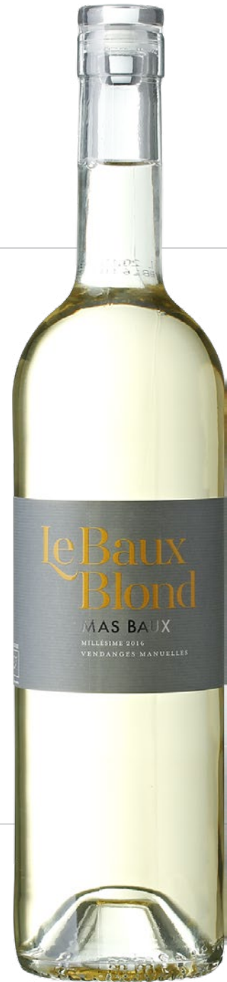
Domaine du Mas Baix