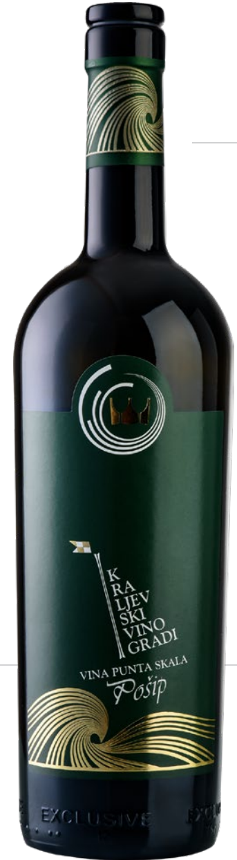
Krajevski Vinogradi, Croatia