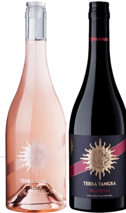
Terra Tangra Winery, Bulgaria