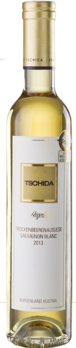
Weingut Hans Tschida