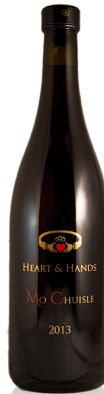
Heart & Hands Wine Company