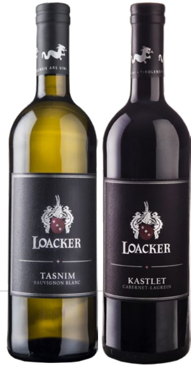
Locker Wine Estates