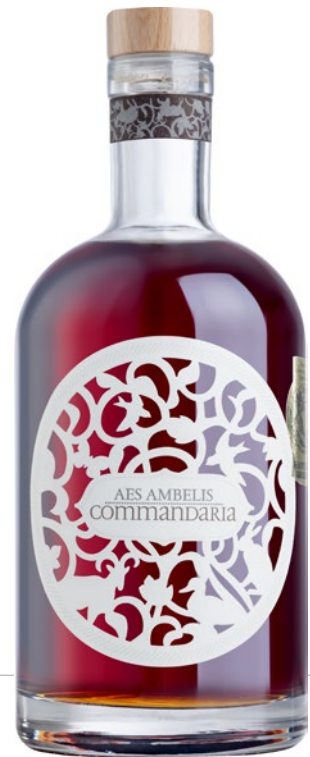
AES Ambelis Winery