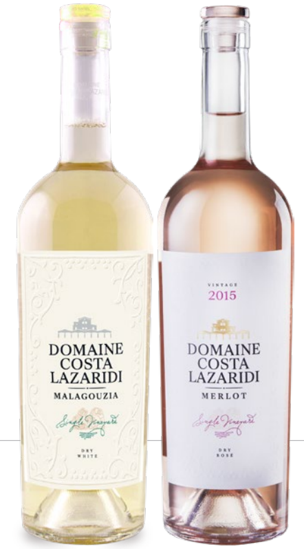
Domaine Costa Lazaridi, Greece