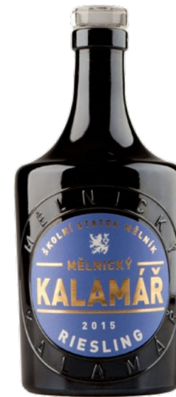
Školní statek Mělník