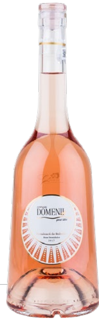
Casa de Vinuri Cotnari