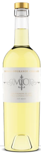
Modus Operandi Cellars