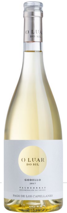
Pago de los Capellanes