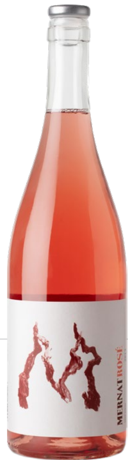
Bodegas Tierras de Orgaz