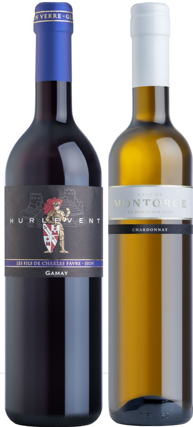
Les Fils de Charles Favre, Switzerland